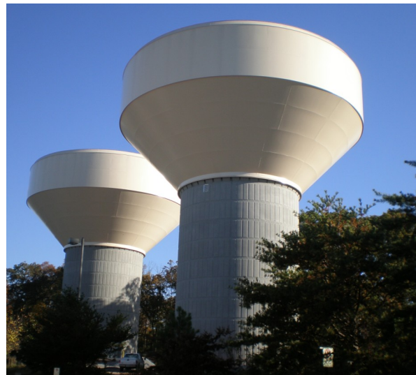
Elevated Storage Tanks

By simply mixing a water storage tank, high quality water may be reliably provided to the end-user. For all climates, mixing is an effective tool for meeting regulatory requirements for control of microbial contaminants and reduction of disinfection byproducts (DBPs). In warm climates, mixing colder, recently-produced water with the solar-heated, top layer of tank volume homogenizes the contents and slows disinfection depletion. In cold climates, tank mixing greatly reduces ice formation and its ensuing damage. Also, for seasonally-populated locales, mixing will provide consistent water quality during low-demand, off-season periods.