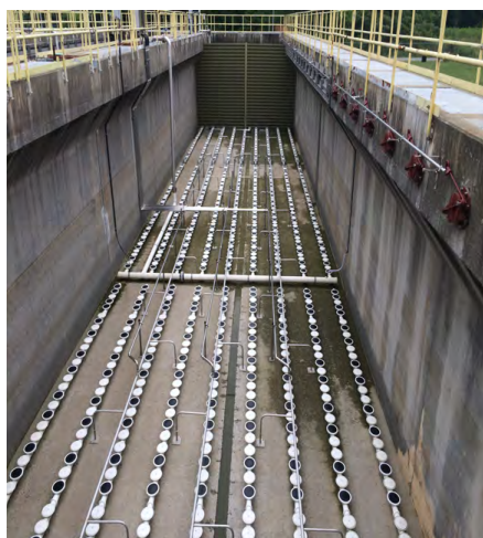
BioCycle-D installation with integrated diffused aeration system and BioMix mixing system.