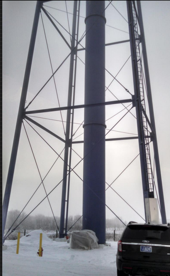
Elevated Water Storage Tank Riser Piping

180 East Bay Street, Suite 200 Charleston, SC 29401 P. (843)573-7510 F. (843)573-7531 www.enviro-mix.com