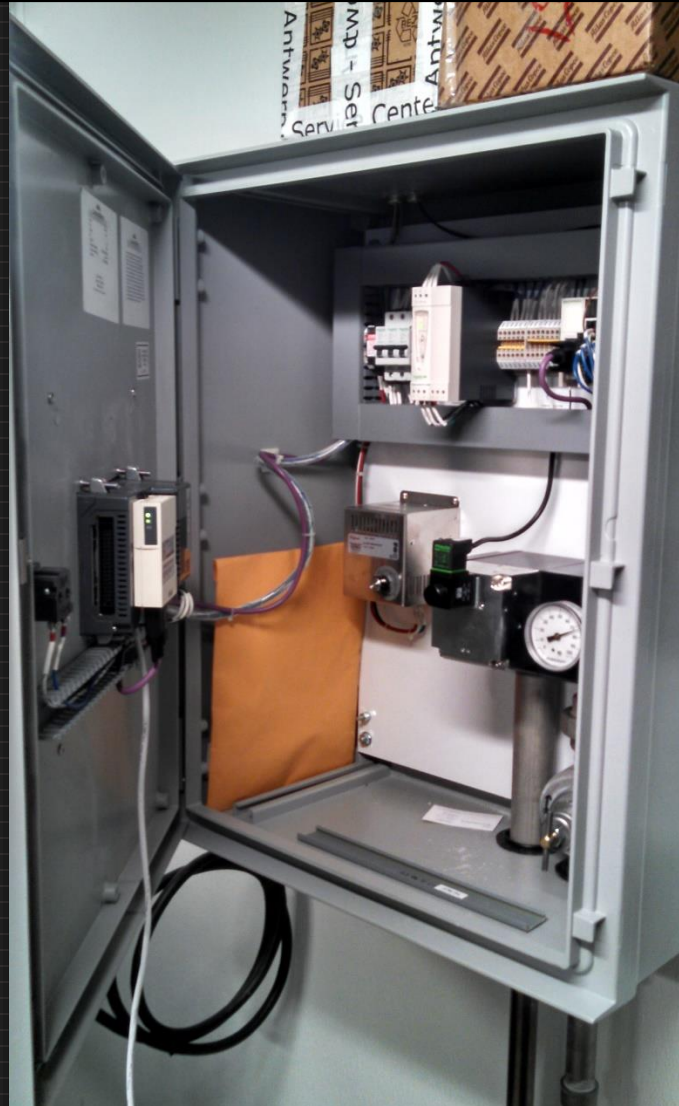
Valve Control Panel