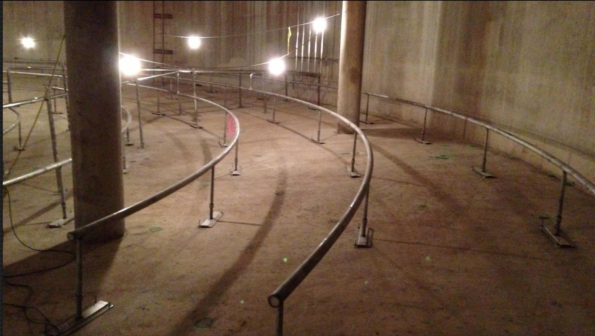
Nozzle Header Installation – Concentric Rings on Sloped Floor