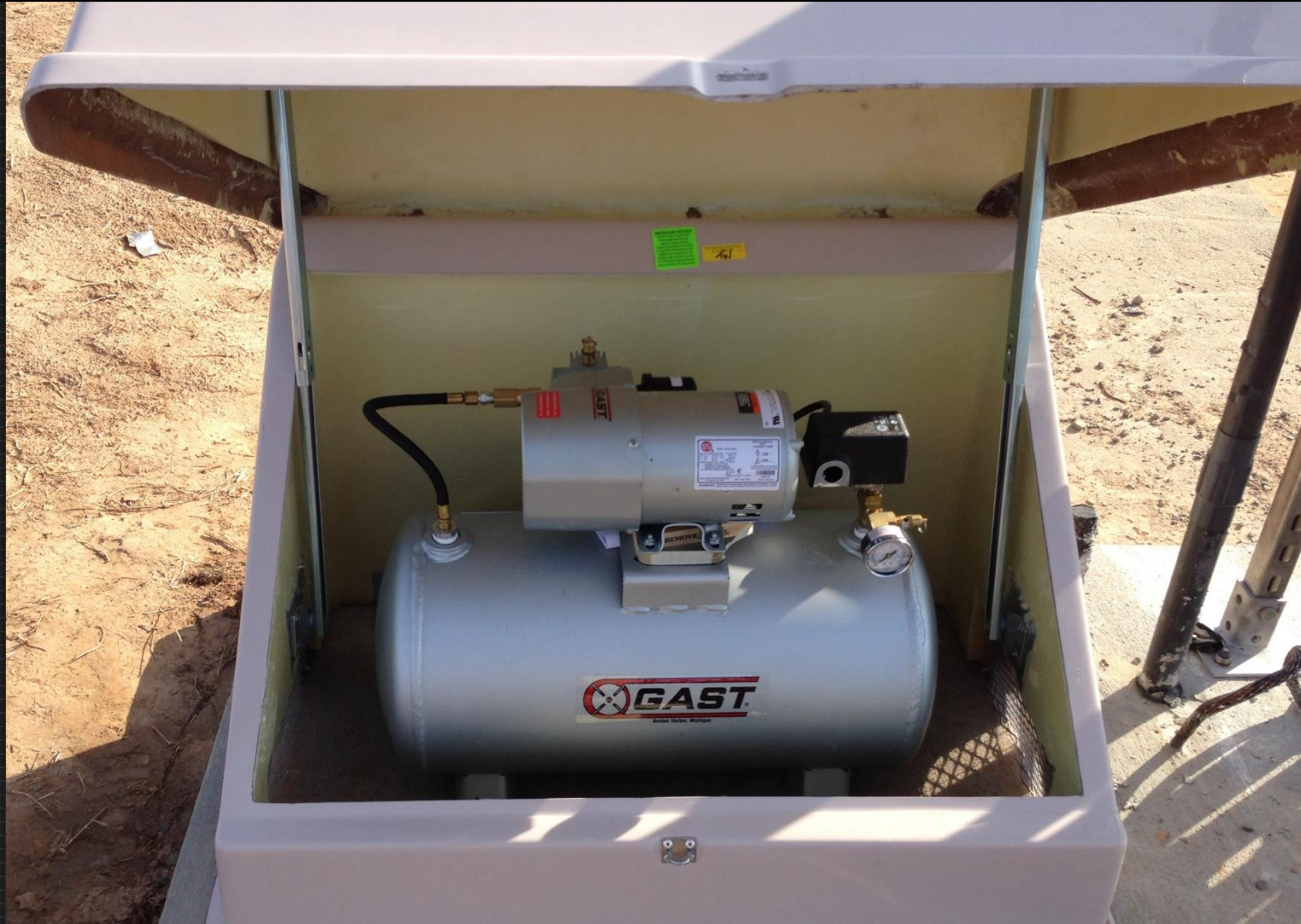
Air Receiver Enclosure