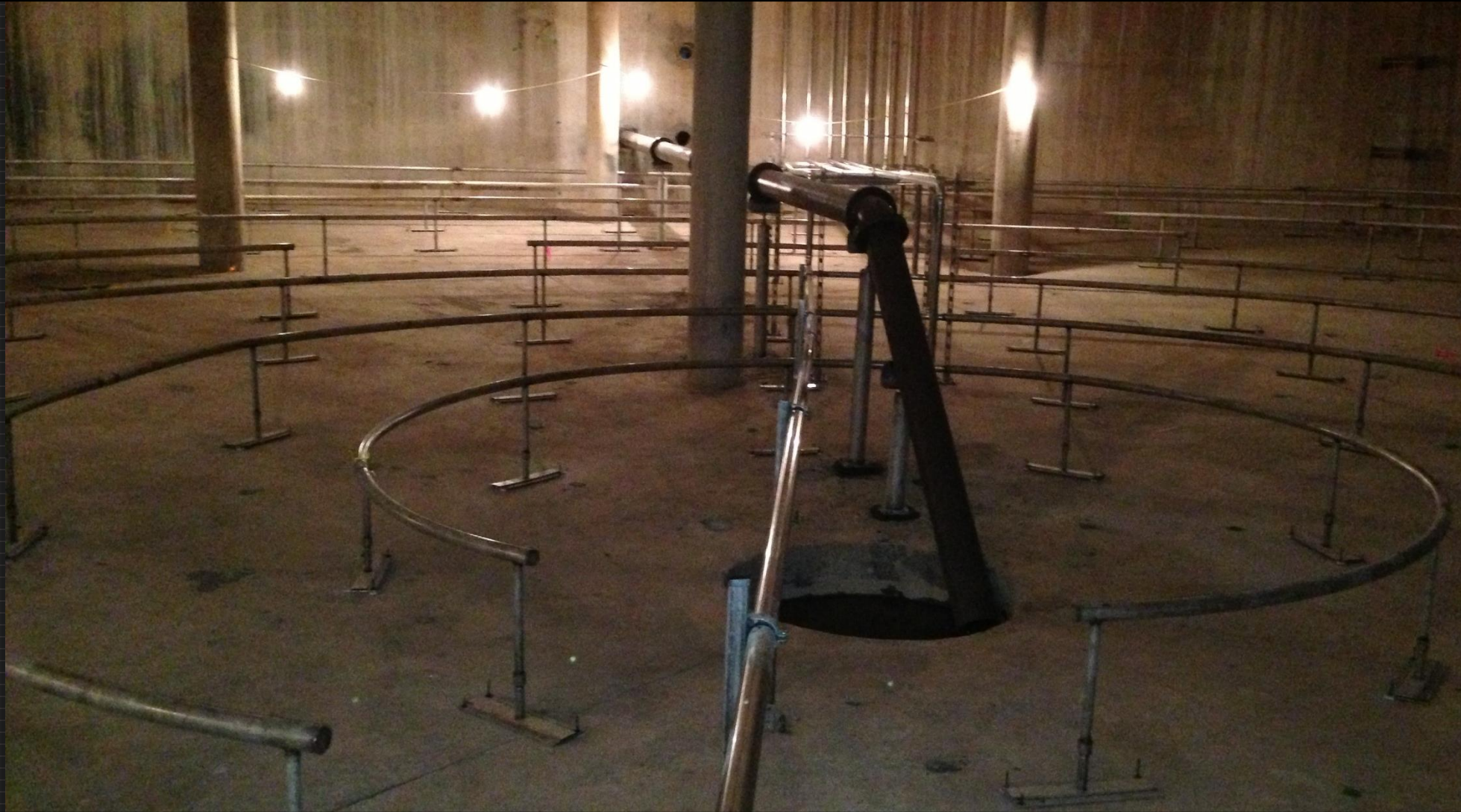
Nozzle Header Installation – Concentric Rings on Sloped Floor