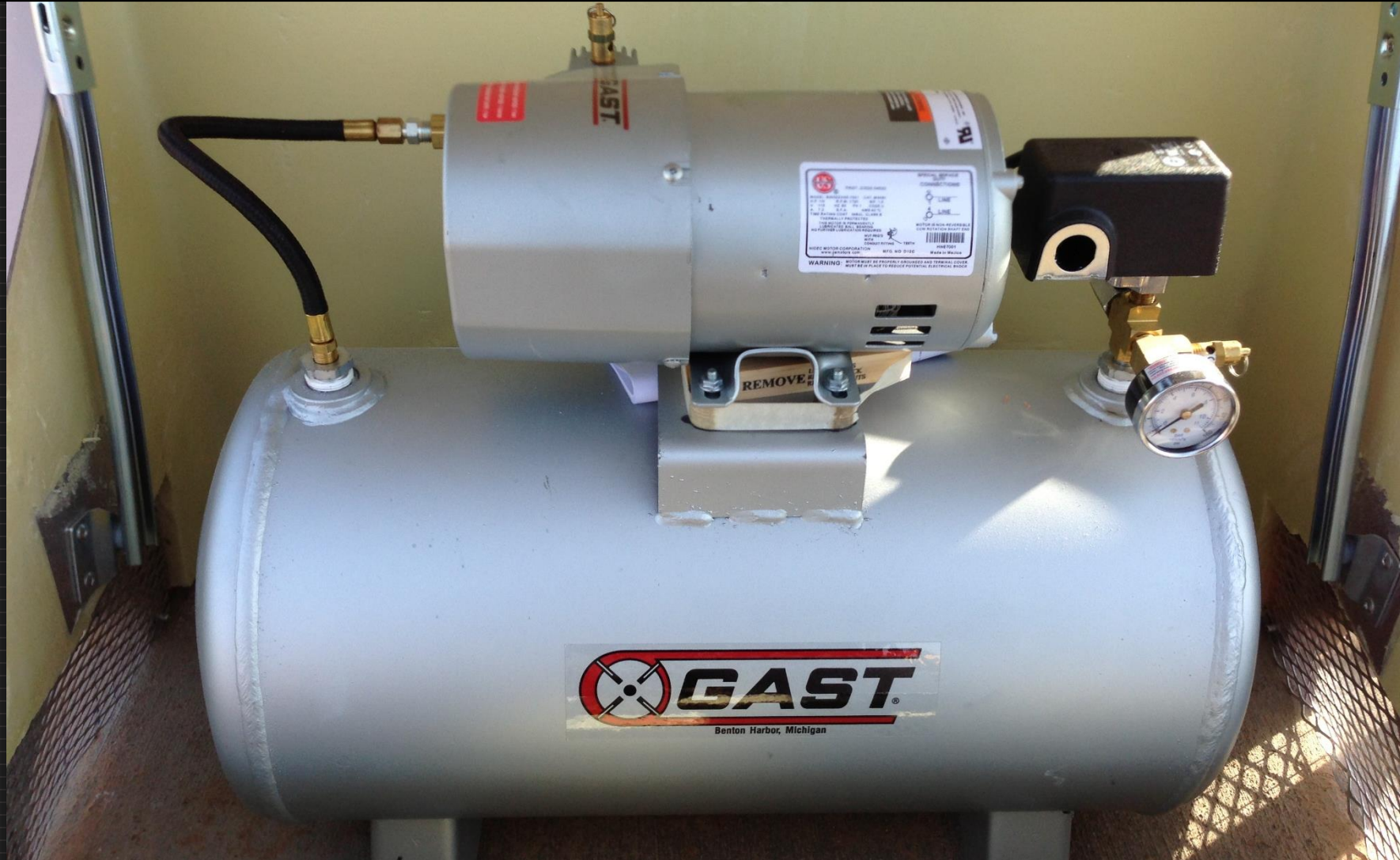
Air Receiver Tank