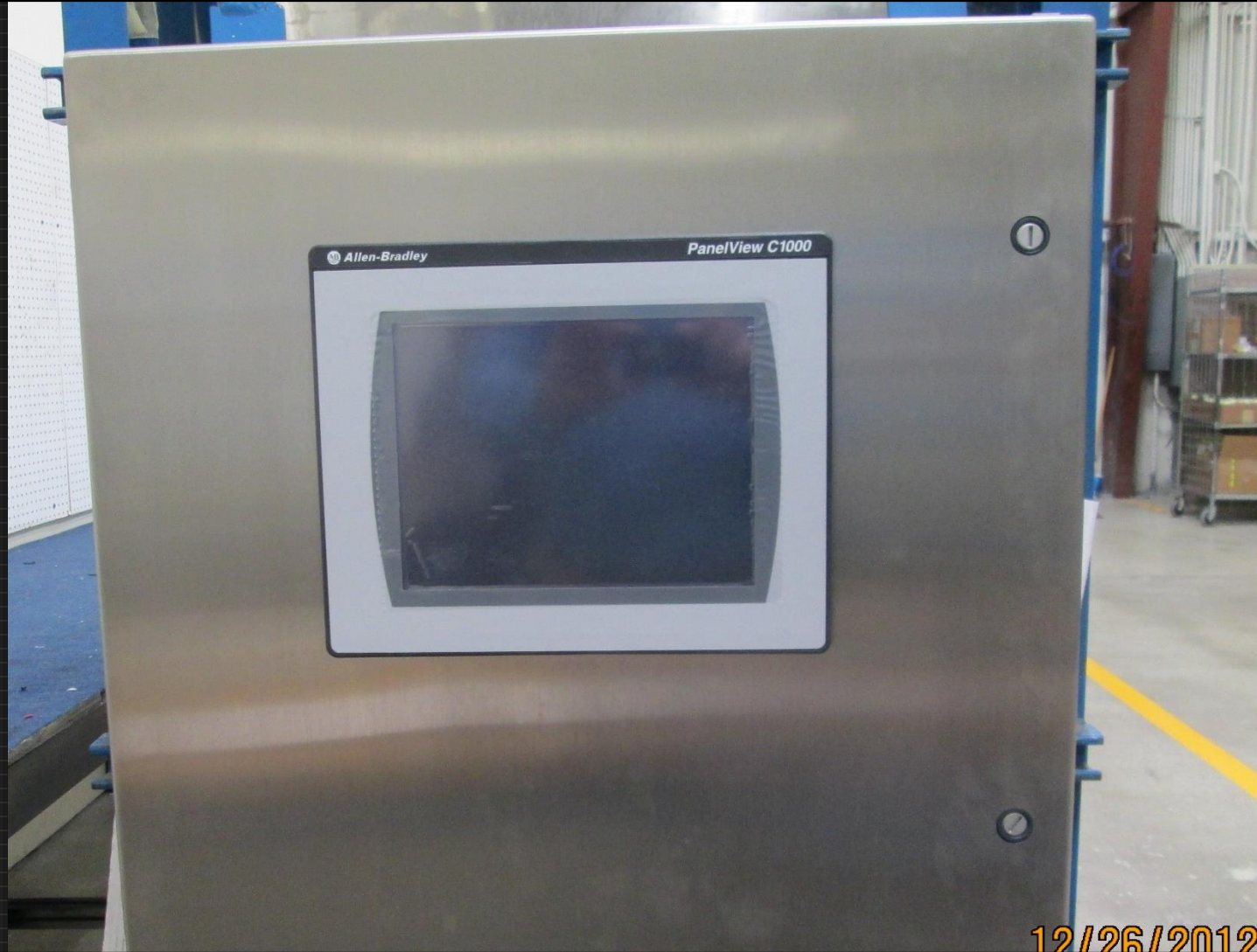
Master Control Panel Pre-installation