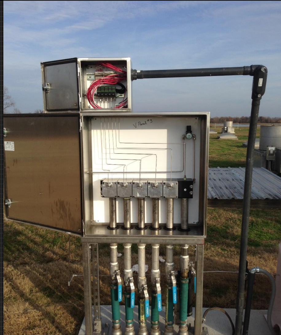
Open Valve Control Panel (VCP)