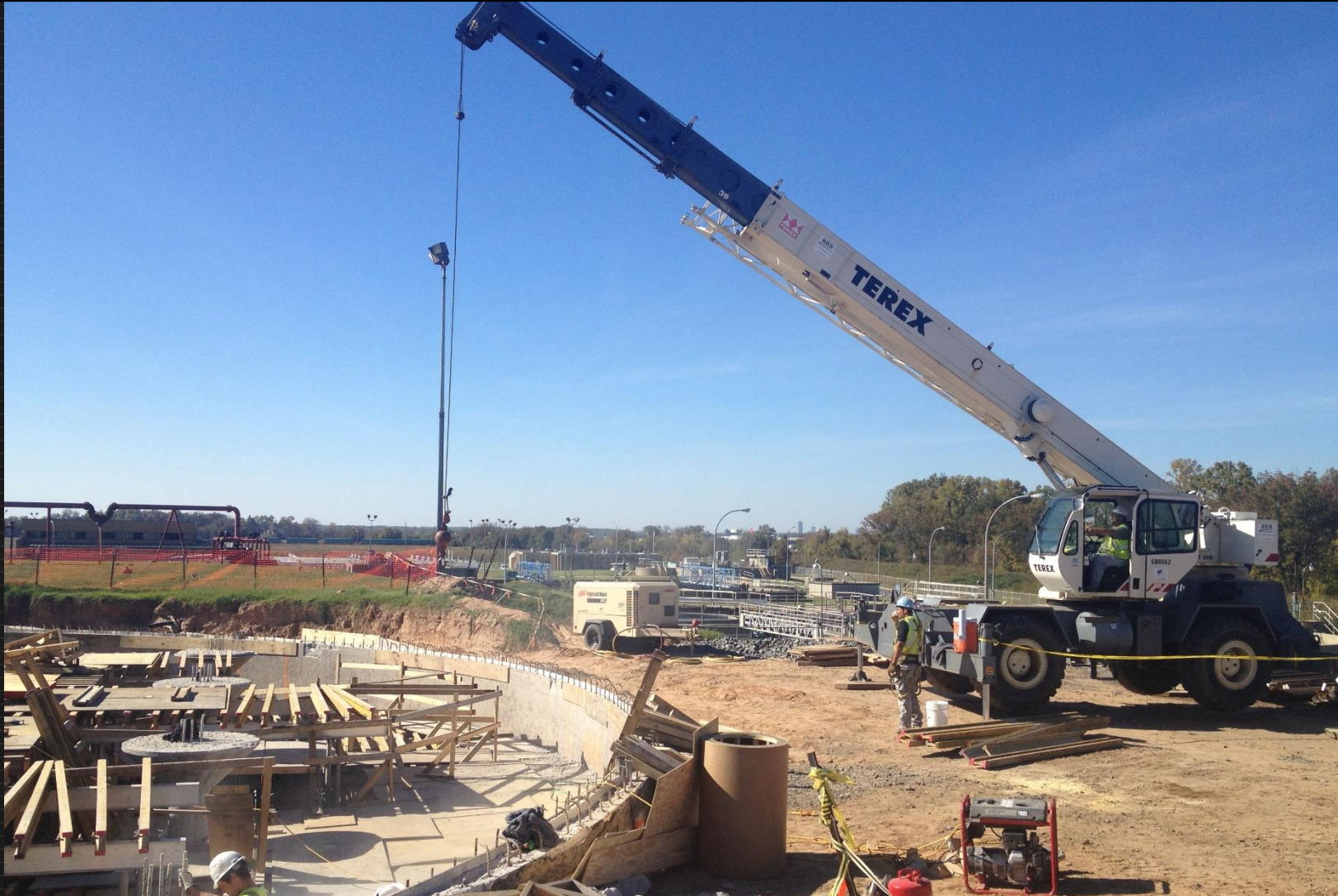
November 2012 Plant Construction