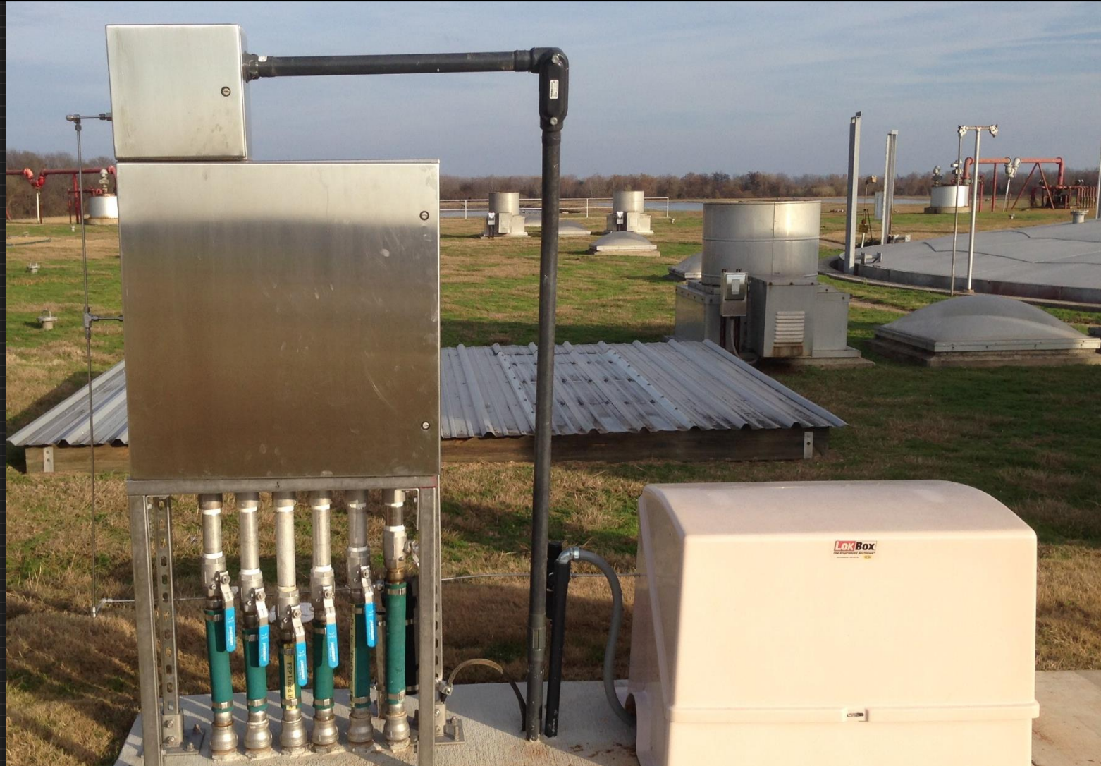
Closed Valve Control Panel (VCP)