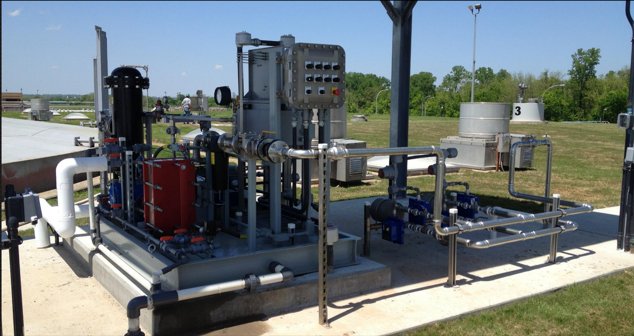
Sliding Vane Compressor Package