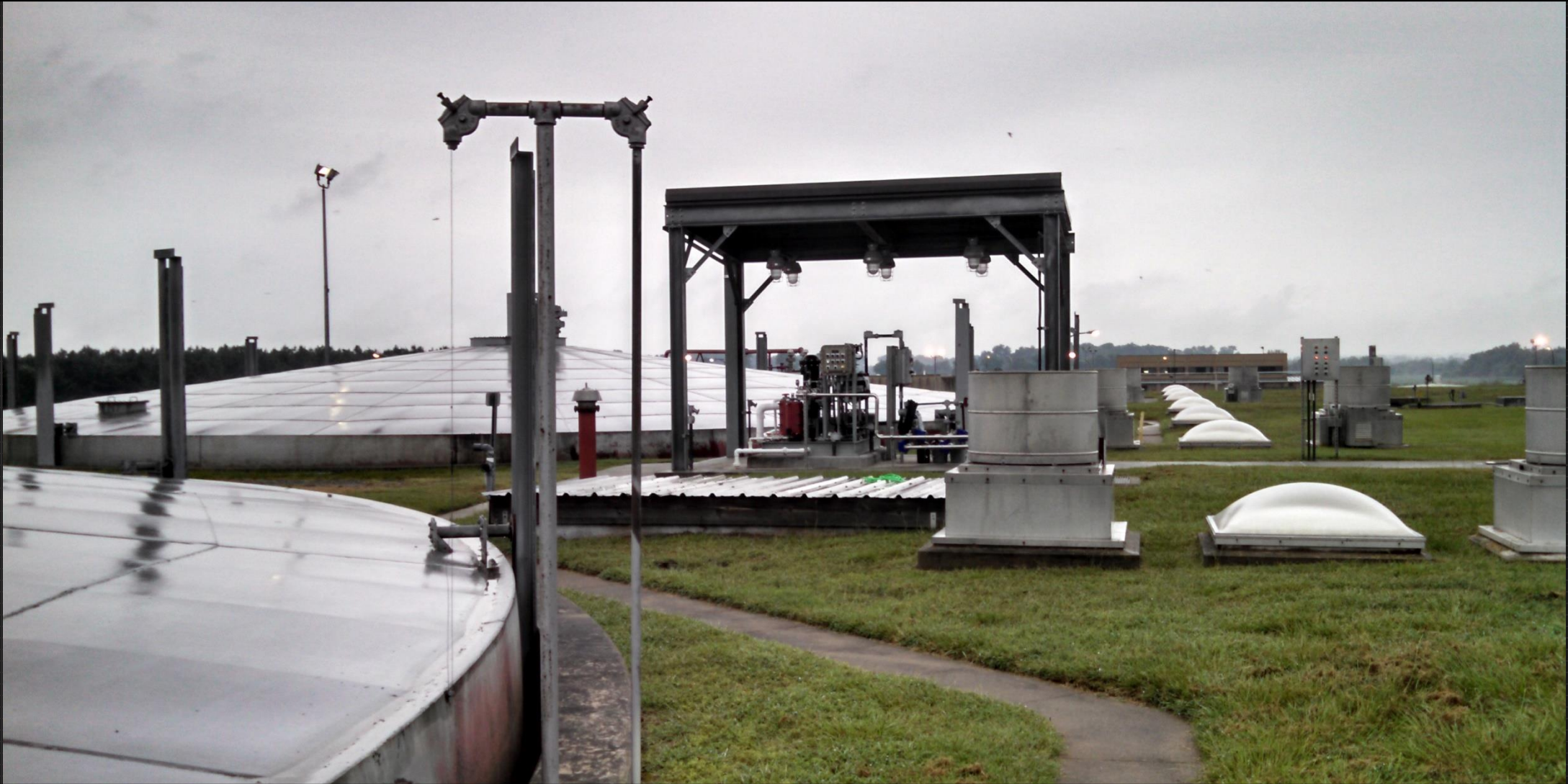
Fourche Creek Anaerobic Digesters