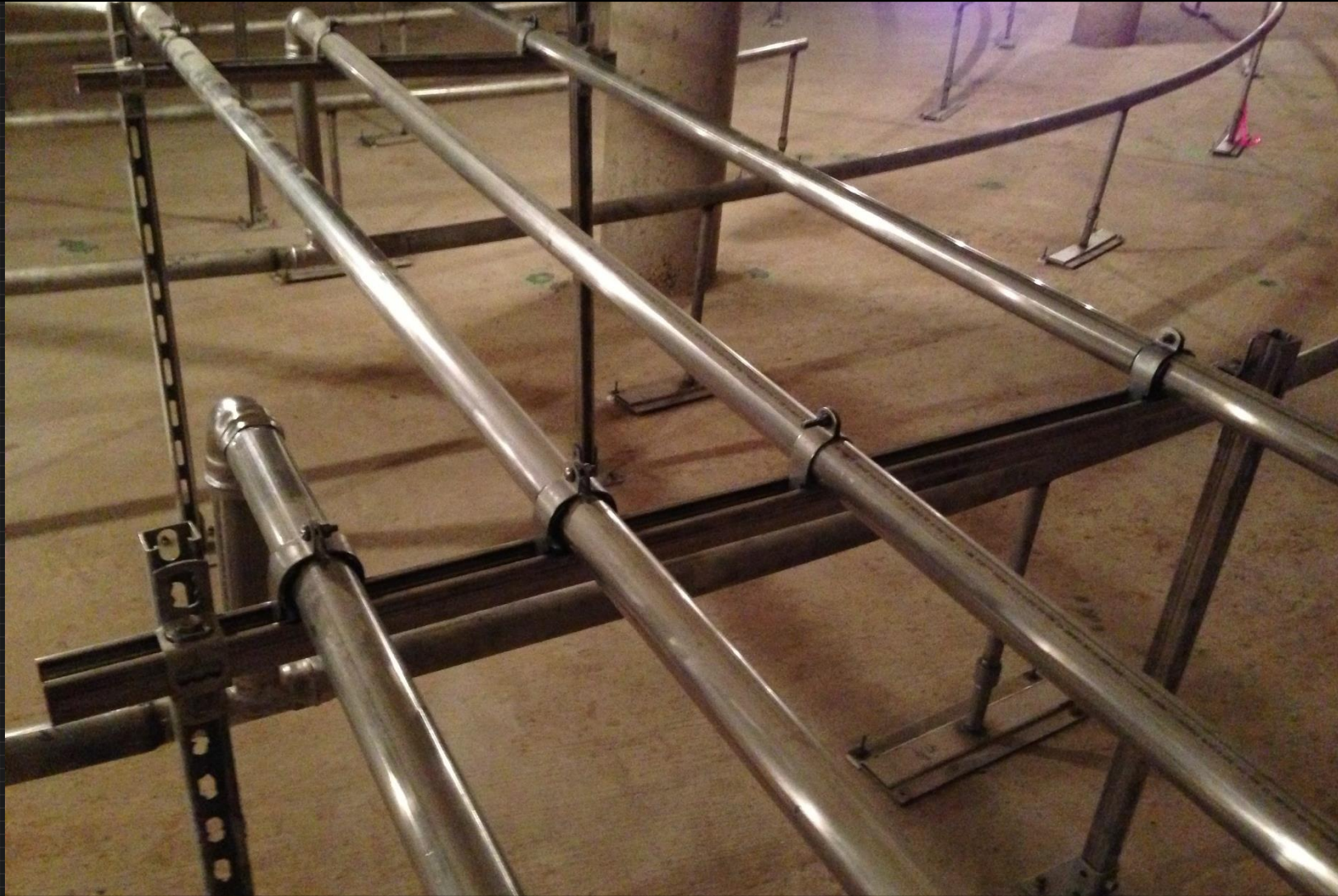
Header Supply Piping Support