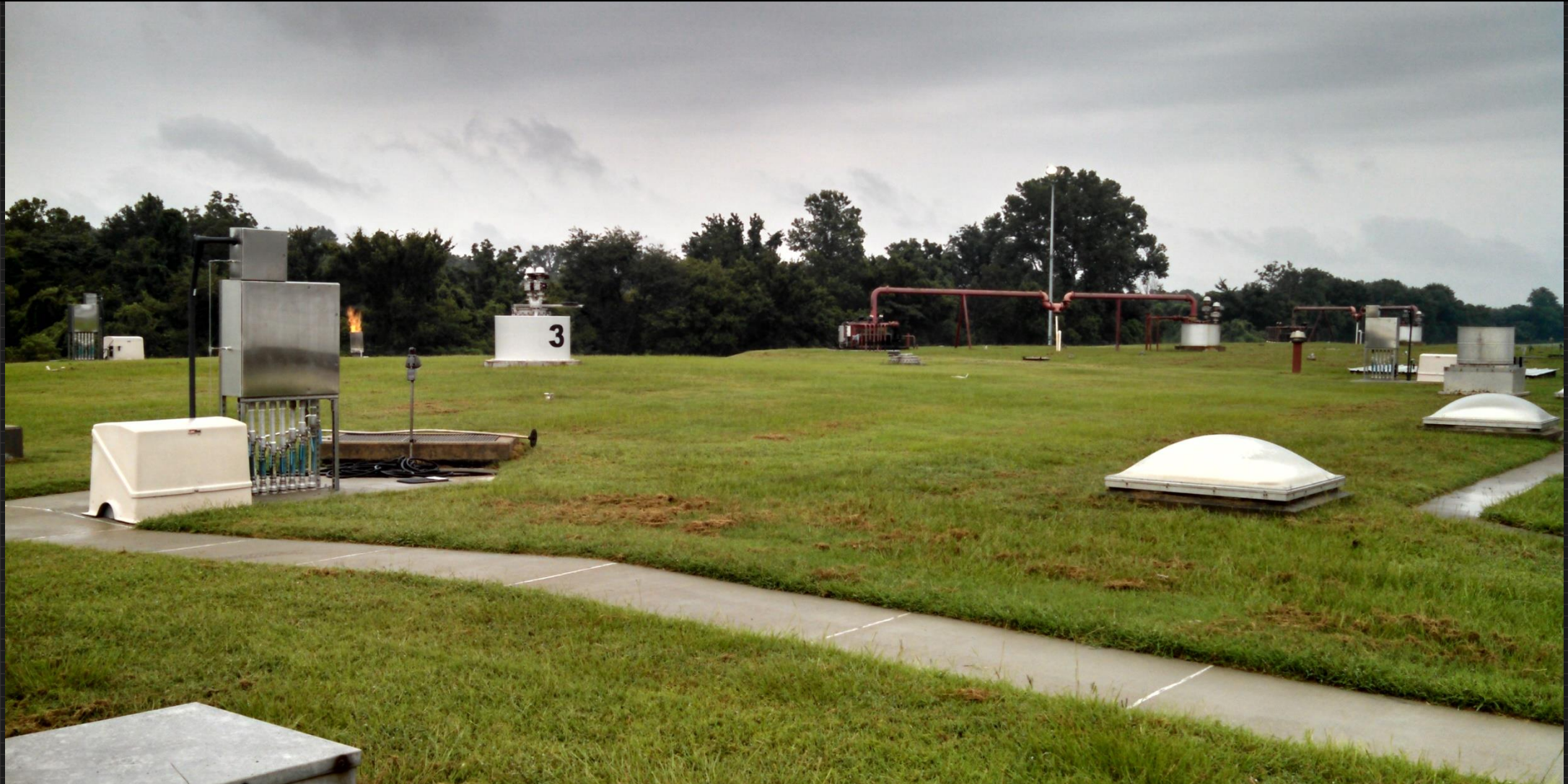
Valve Control Panels