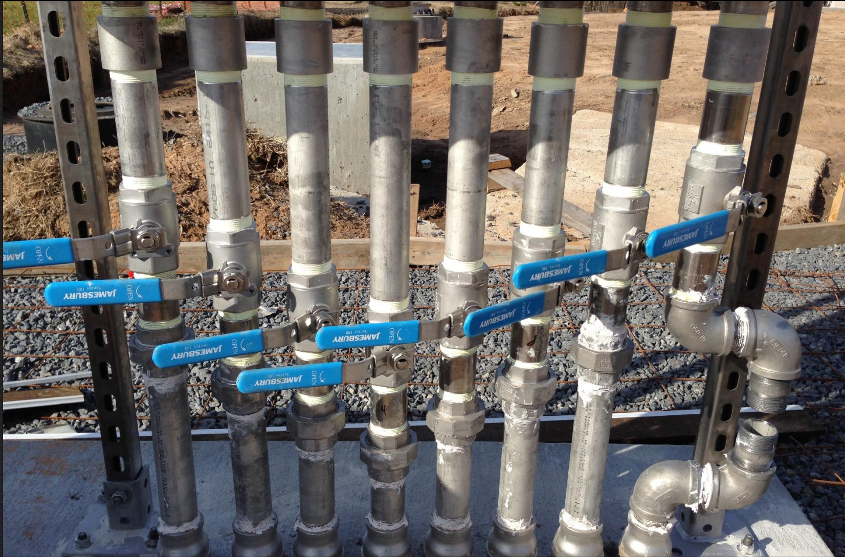
Ball Valves coming from the VCP to header supply piping