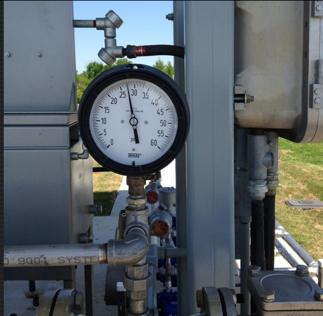
Standard Operating Pressure