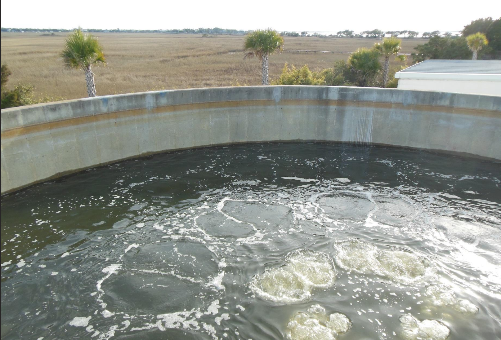
Center Ring Firing