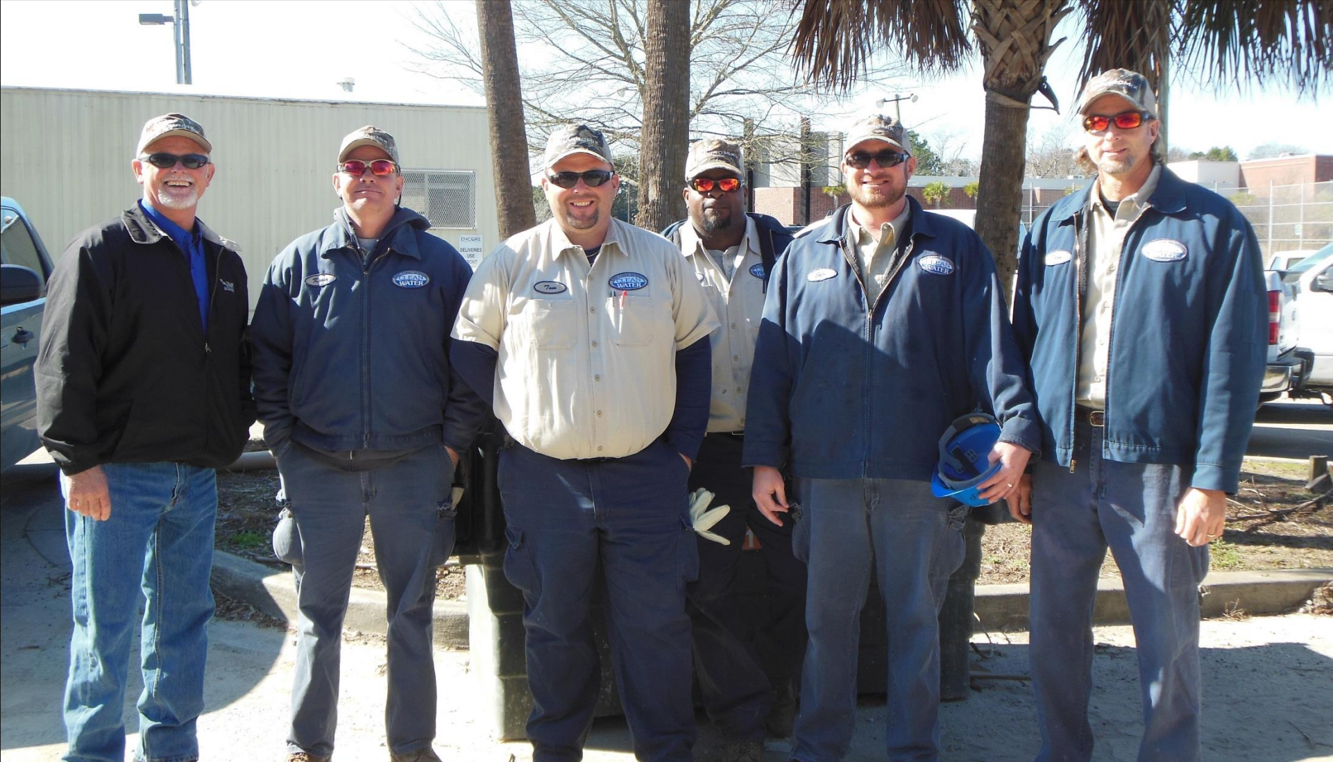
Mt. Pleasant Waterworks Operators in their new EnviroMix, Inc. hats.