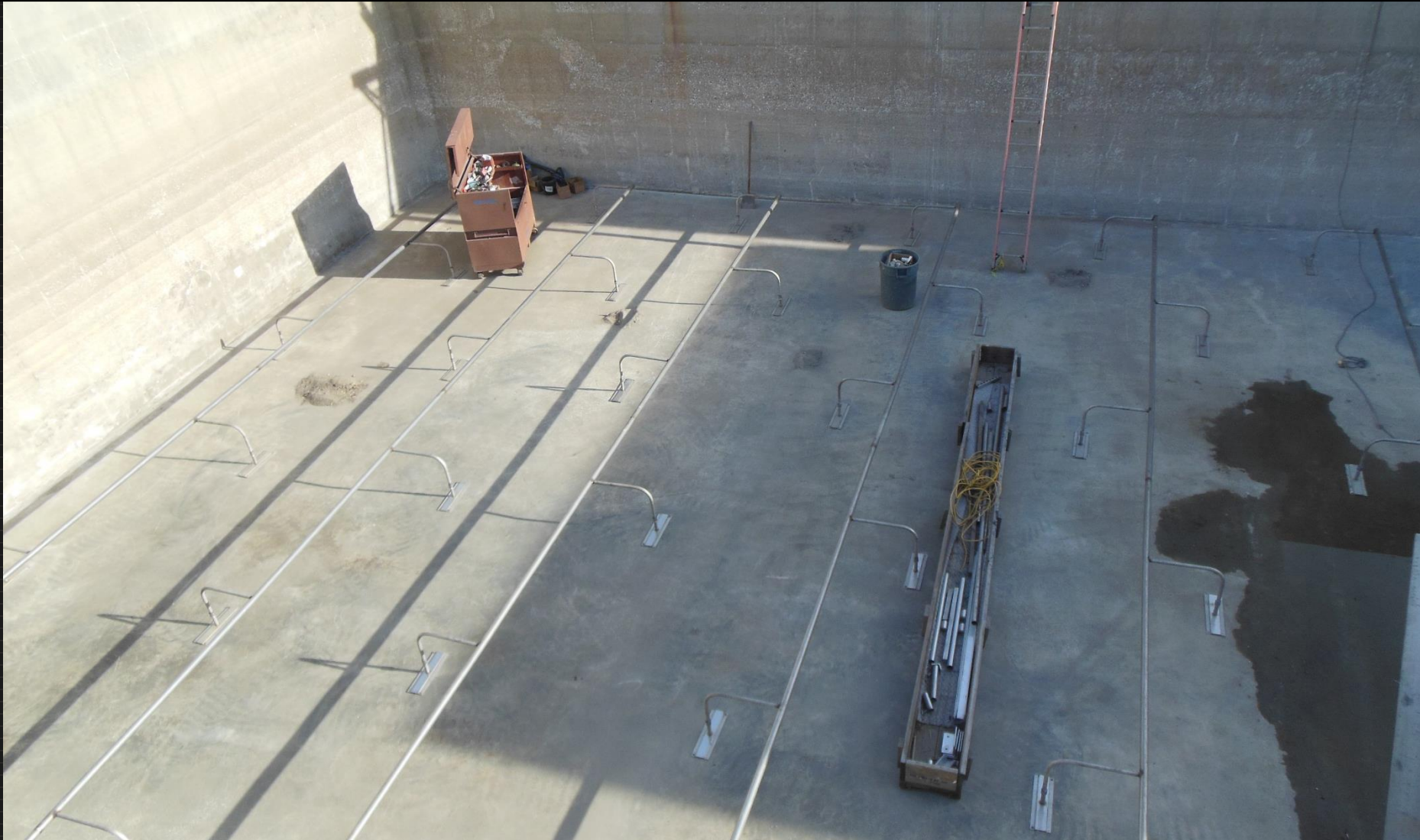
EQ Tank Nozzle Header Installation