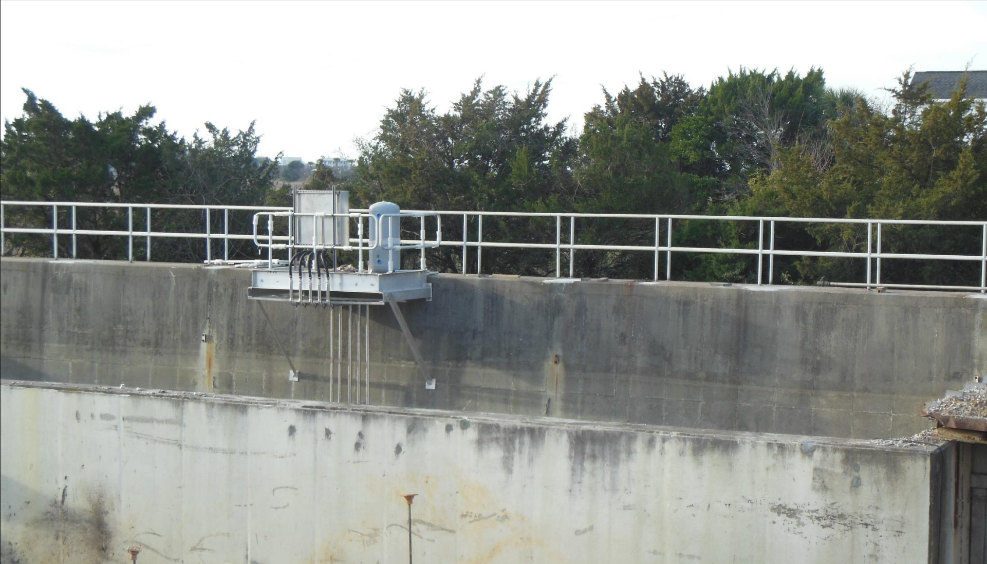
EQ Tank Valve Control Panel (VCP) and Receiver Tank