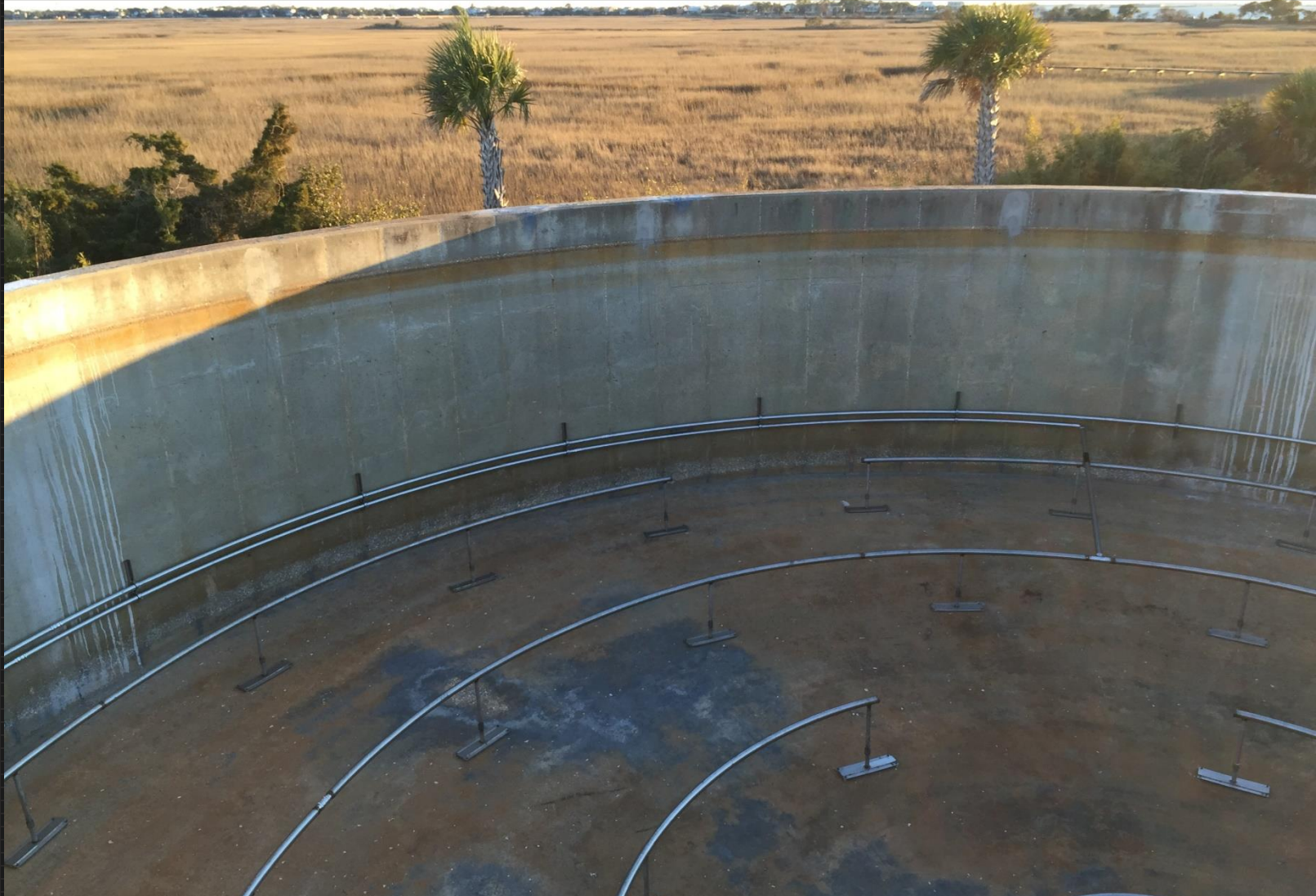
Anoxic Tank Nozzle Headers