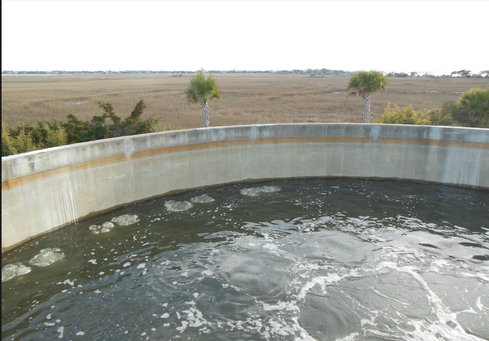
Outer Header Ring Firing