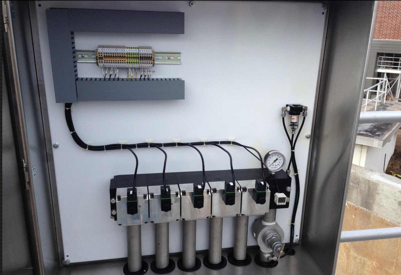
Anoxic Tank Valve Control Panel