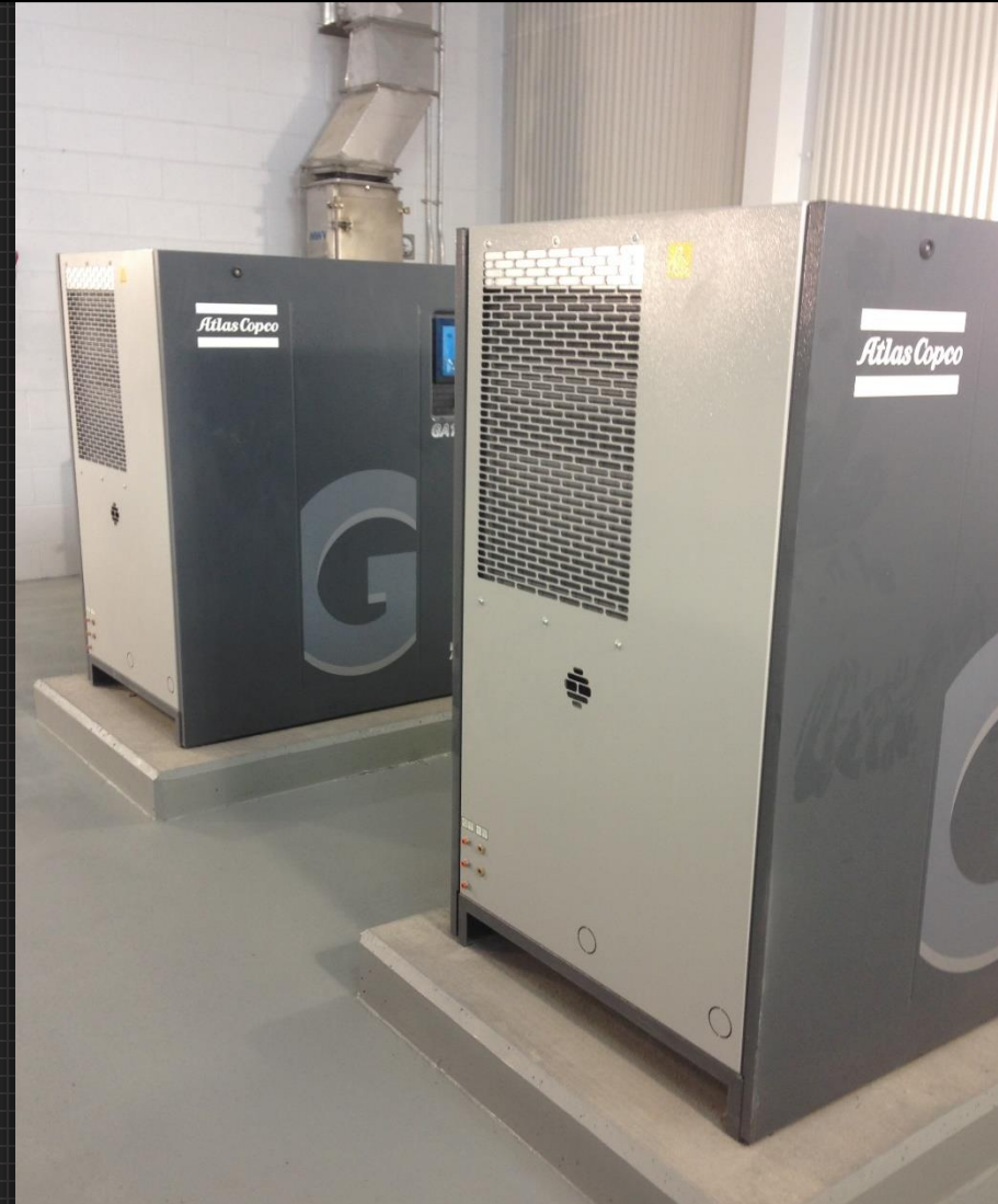
Duty and Standby Compressor