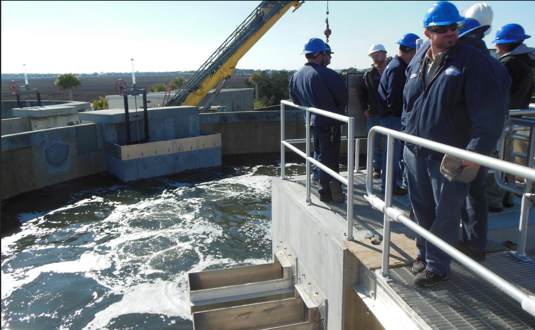
BioMix™ System Training at the Valve Control Panel of Anoxic Tank 1