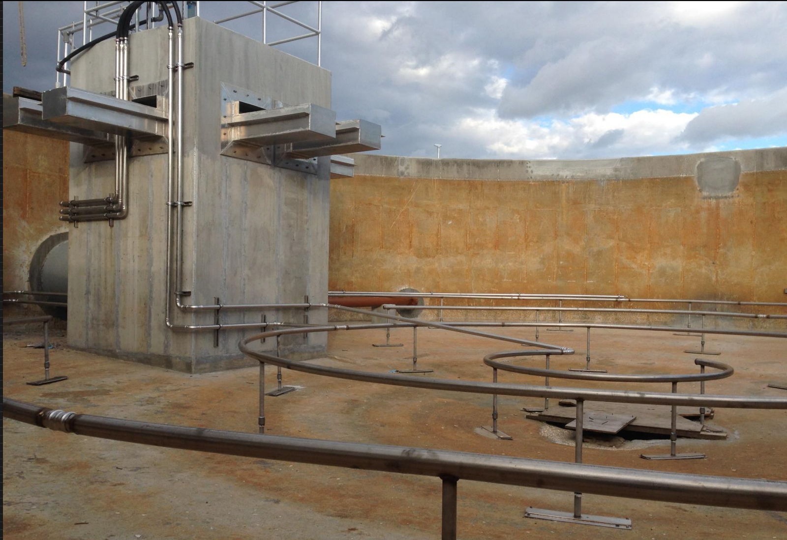
Anoxic Tank Nozzle Header Installation