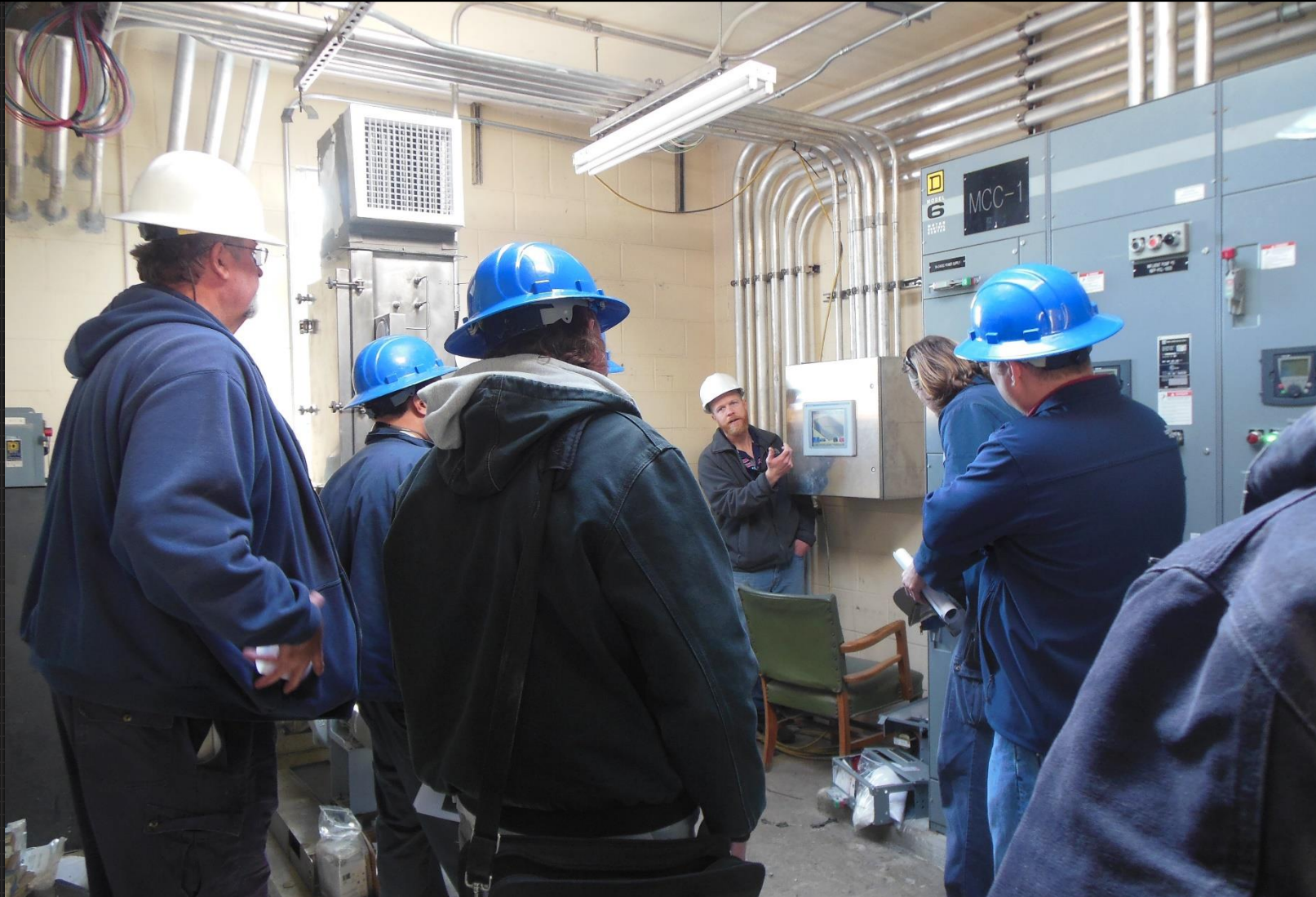
BioMix™ System Training at the Master Control Panel