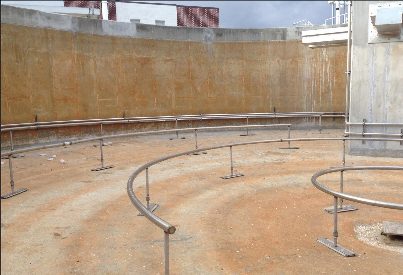
Anoxic Tank Nozzle Header Installation