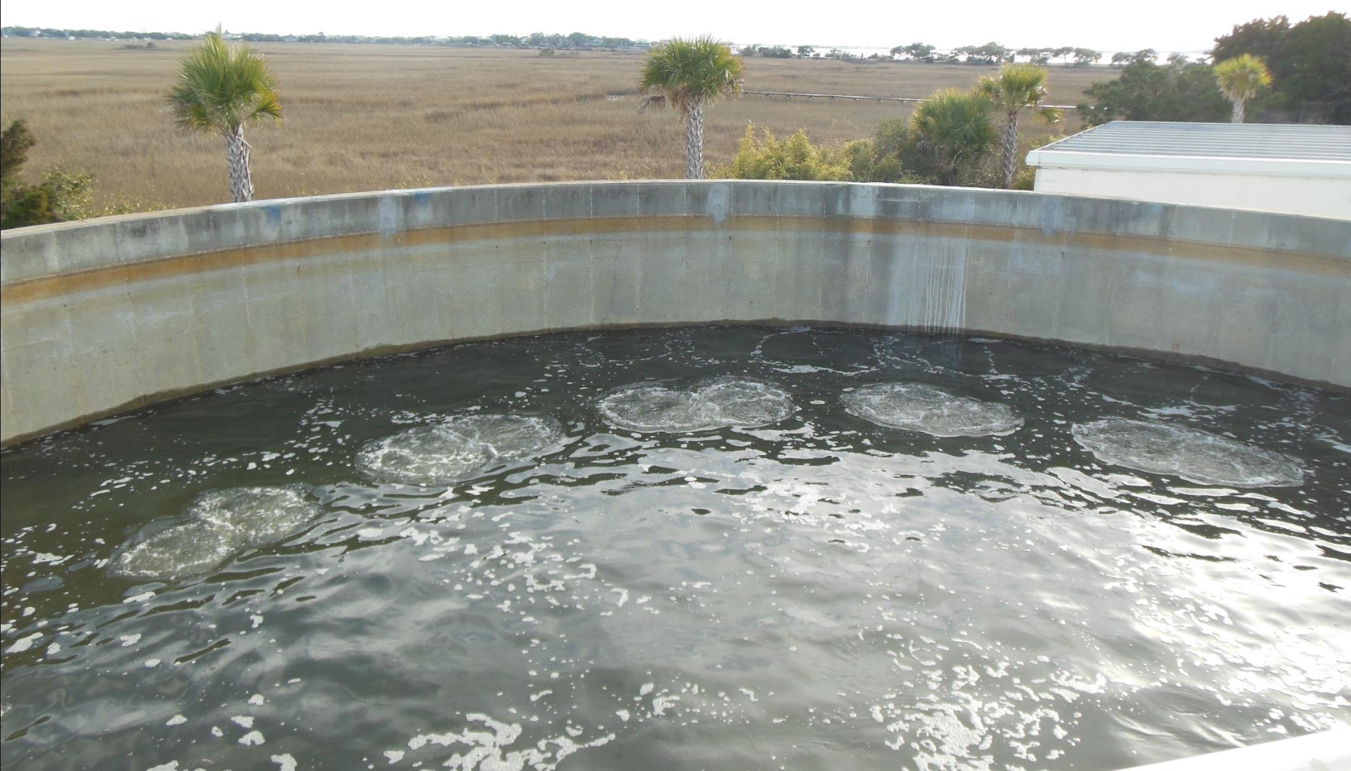
2 nd Header Ring Firing