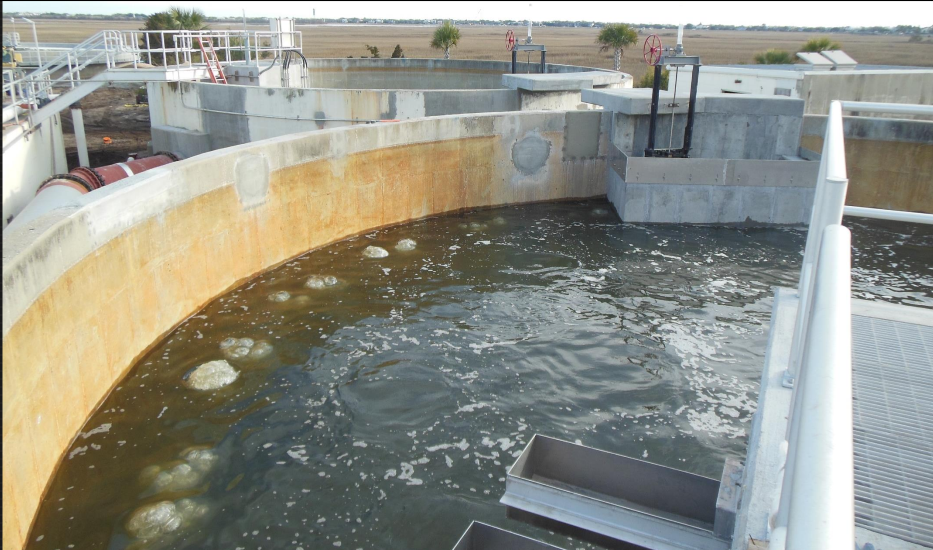
Anoxic Tank Start-Up January 2015