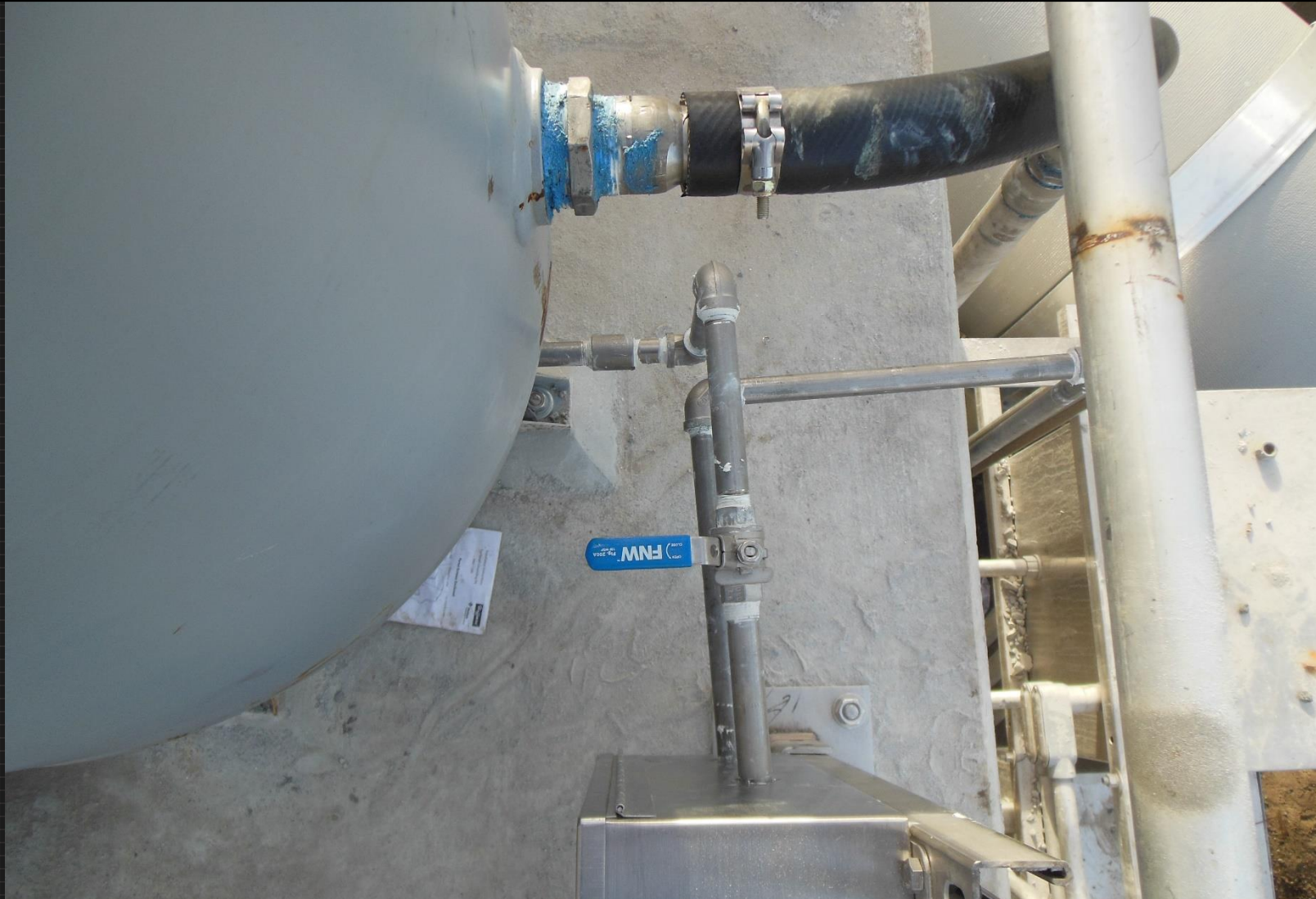
Receiver Tank Auto-Drain