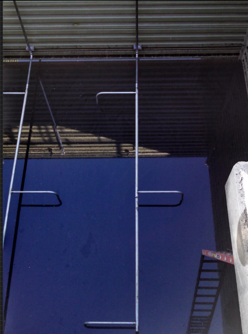
Nozzle Header Installation