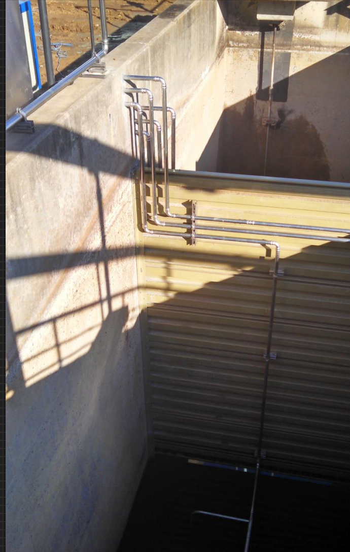
Header Supply Piping Installation