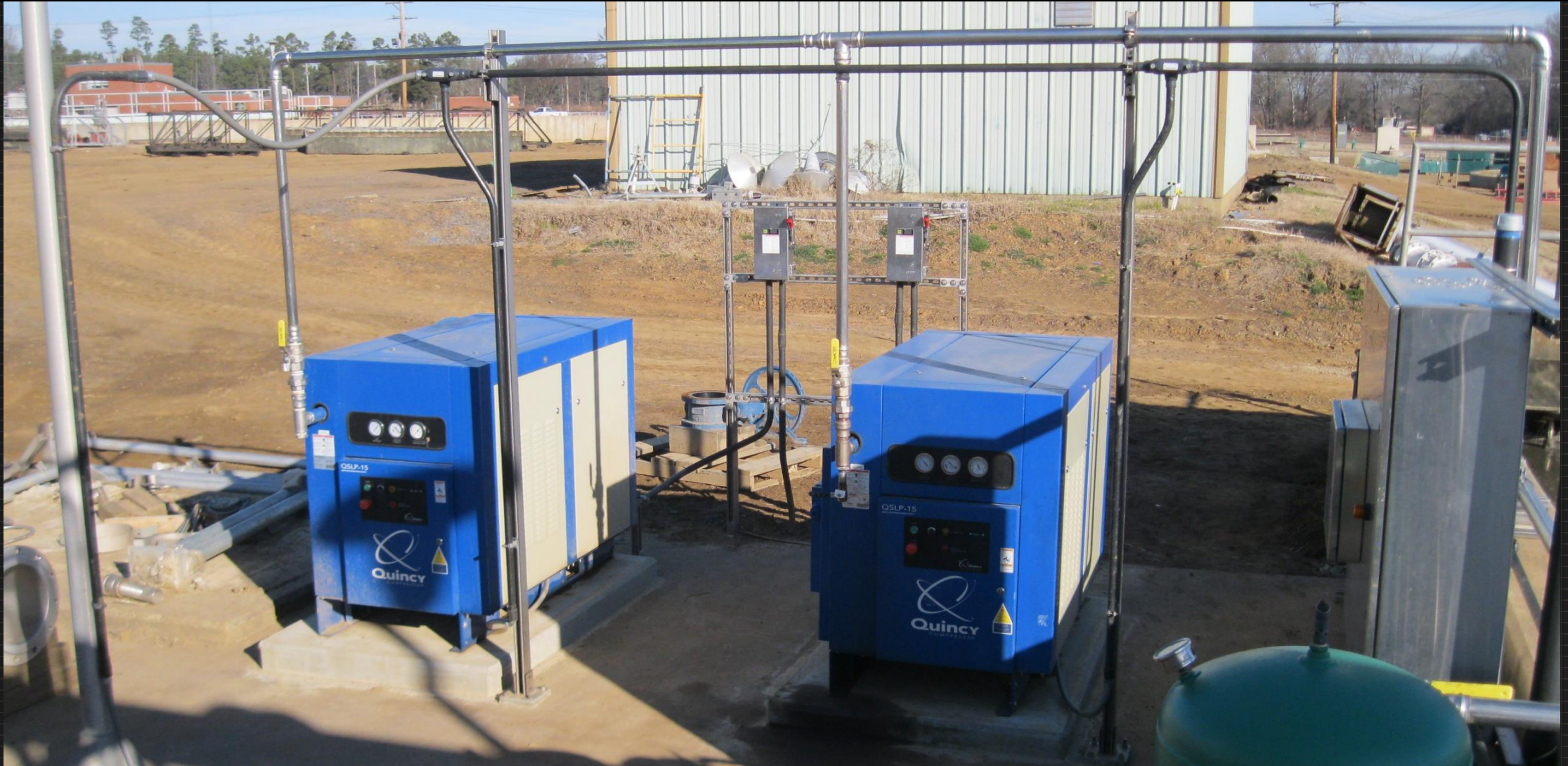
Duty and Standby Compressor