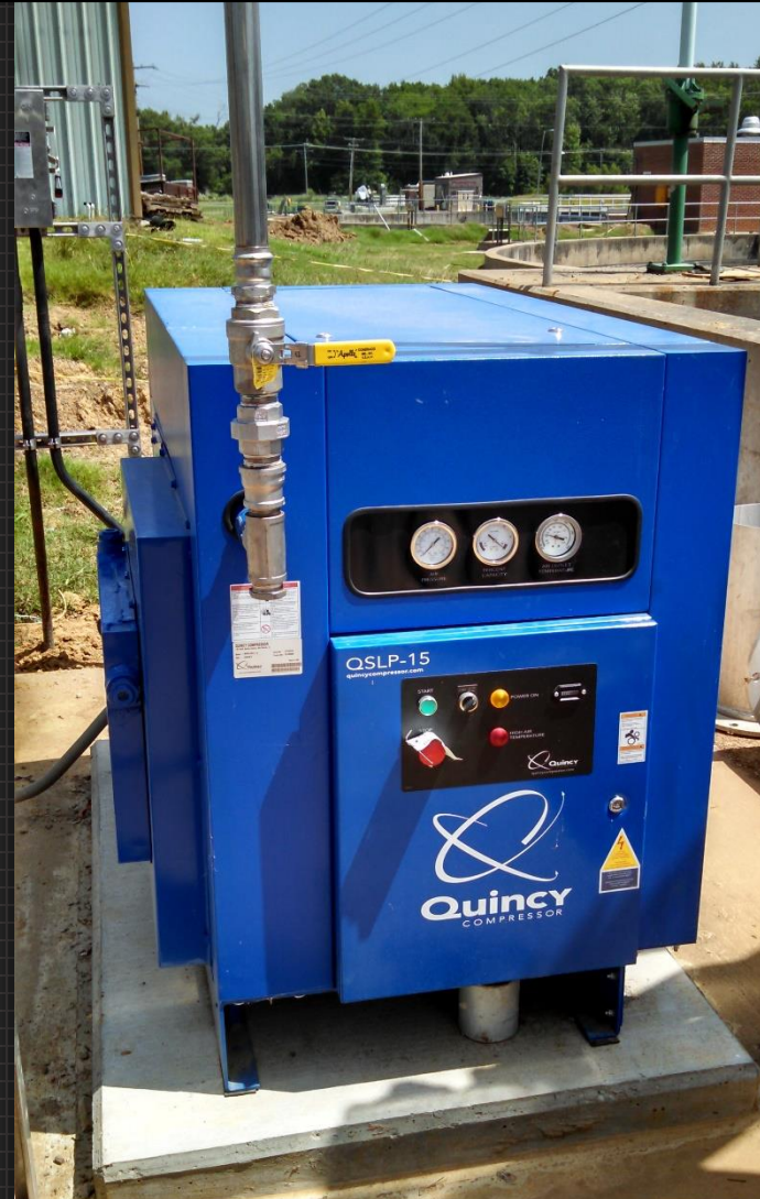
Quincy QSLP-15 Air Compressor