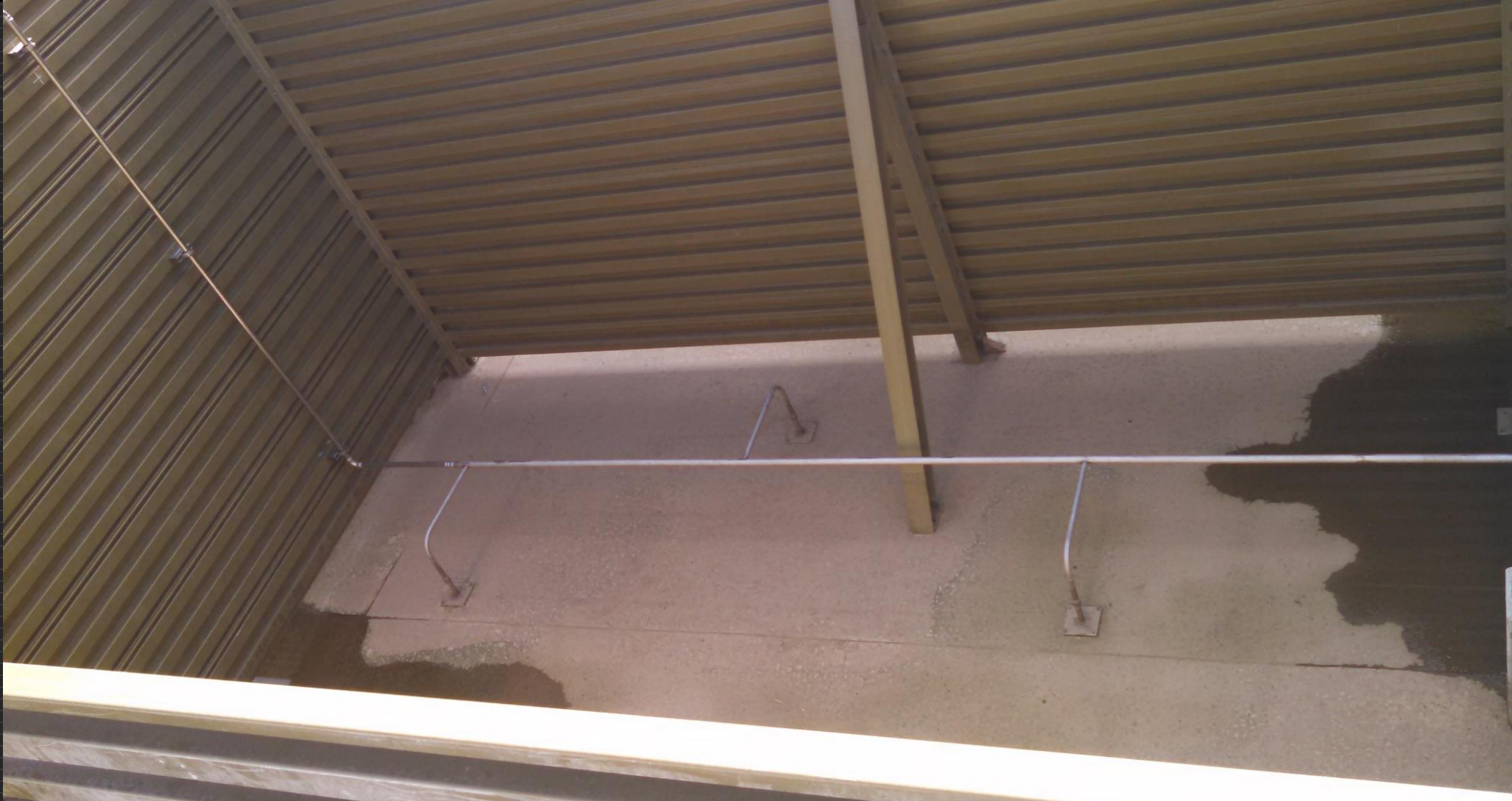
Nozzle Header Installation