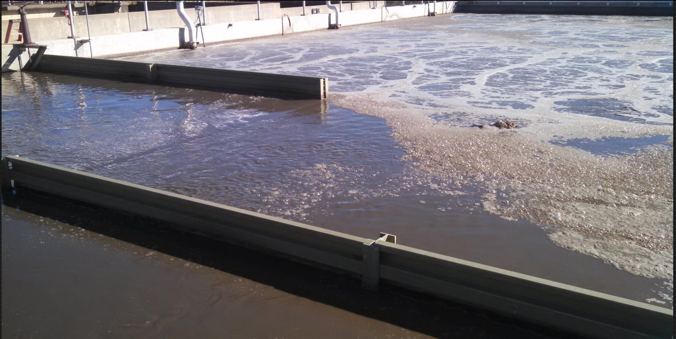
Efficient BNR Mixing with BioMix™ Compressed Gas Mixing System