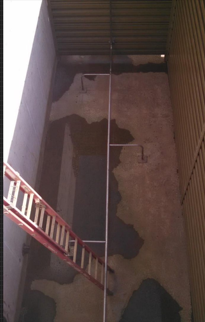
Nozzle Header Installation