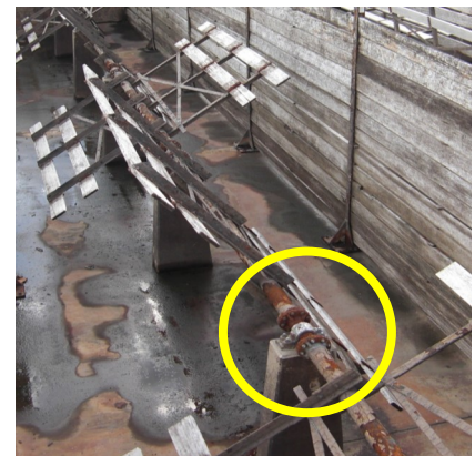
Corroded Mechanical Flocculator

Mechanical flocculators require at least one motor per basin. However, AquaBlend-FT system power utilization is efficiently applied across multiple tanks, by using a single, optimally-sized and easily-maintained compressor.