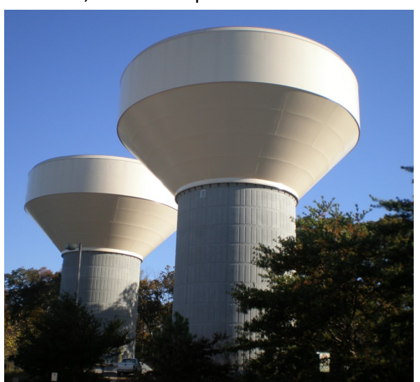
Elevated Storage Tanks All AquaBlend™ installations share the following characteristics:

By simply mixing a water storage tank, high quality water may be reliably provided to the end-user. For all climates, mixing is an effective tool for meeting regulatory requirements for control of microbial contaminants and reduction of disinfection byproducts (DBPs). In warm climates, mixing colder, recently-produced water with the solar-heated, top layer of tank volume homogenizes the contents and slows disinfection depletion. In cold climates, tank mixing greatly reduces ice formation and its ensuing damage. Also, for seasonally-populated locales, mixing will provide consistent water quality during low-demand, off-season periods.