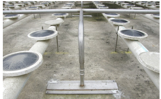
BioMix Configuration Example

liquid, the larger the bubble, the less oxygen transfer. As examples, one ft 3 of diffused air produces 51,600 coarse ( \pm 0.4'' \text{ } \varnothing ) spherical bubbles with 180 ft 2 of surface area, or 51,566,200 fine ( \pm 0.04'' \text{ } \varnothing ) bubbles with 1800 ft 2 of surface area. By comparison, the same volume yields just 60 softball-sized (3.8'' \varnothing ) bubbles with 18.9 ft 2 of surface area—a reduction of 90% (coarse bubble) or 99% (fine bubble).