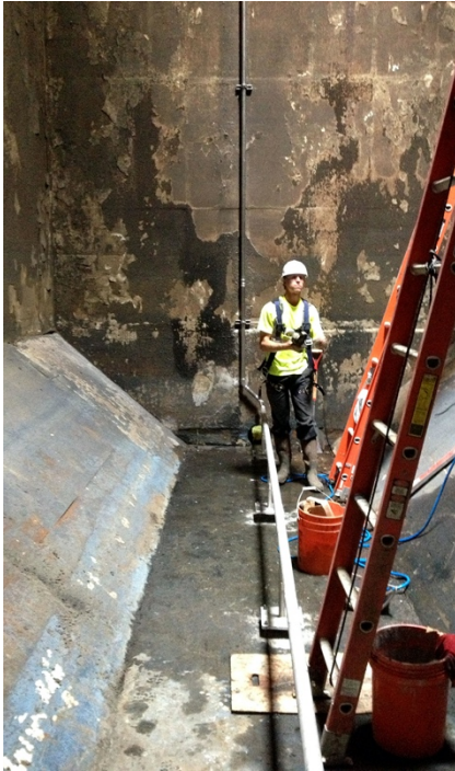
Nozzle Header Installation