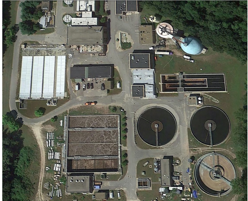
Nashua Wastewater Treatment Facility

“...the money saved through the use of an efficient mixing system will have a significant, positive impact on our O&M budget.”