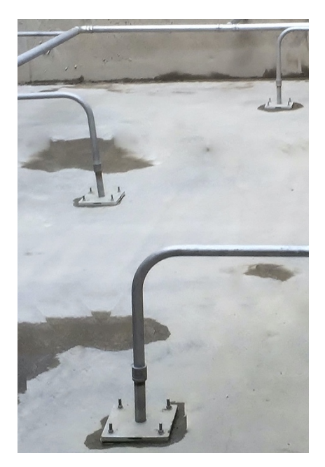
Nozzles mounted at the tank floor maximize bottom-up mixing regime.

Instead of requiring numerous submersible mixers, BioMix achieves efficient mixing with <u>one</u> centralized compressor, significantly reducing maintenance requirements.