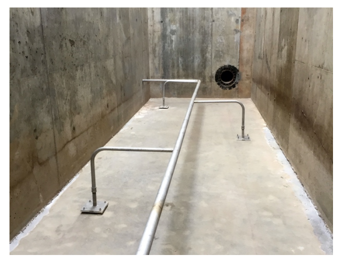
Nozzle headers are well-suited for long narrow basins.