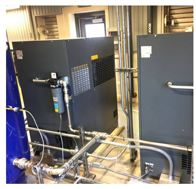
Low maintenance compressor system matches mixing air demand with duty and standby configuration.

BioMix provides low operating costs, reduced maintenance, and improved mixing versus the previously installed coarse bubble aeration system.