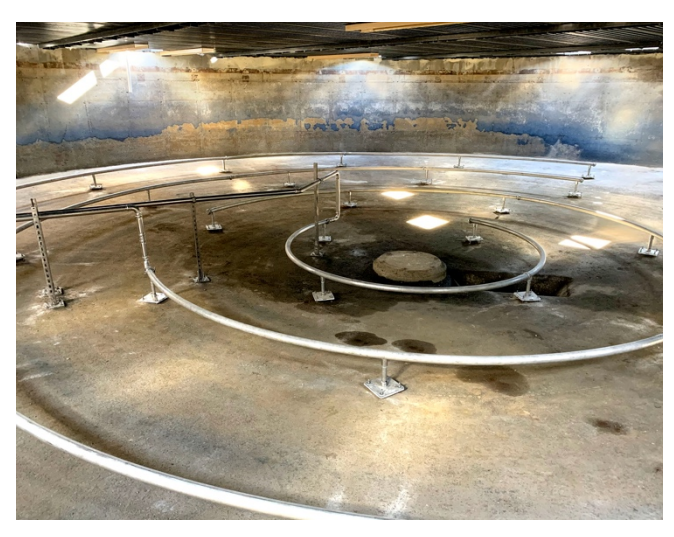
Concentric rings of nozzle headers uniformly mix the basin contents from the bottom up.