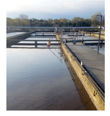
Long periods without mixing create a fermentation layer, and intermittent pulses of mixing transport VFAs without disrupting the layer.