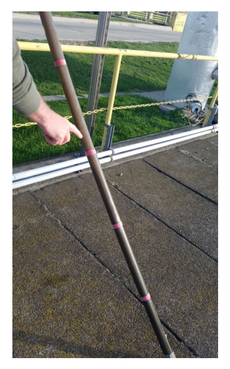
Testing samples reveal the creation of a VFA-producing fermentation layer.