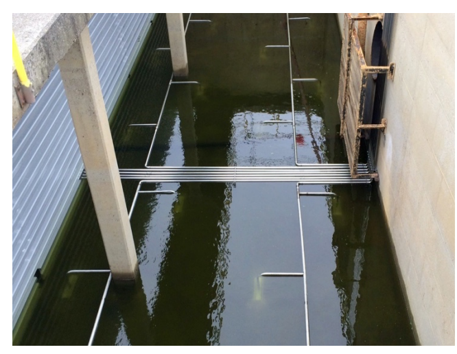
BioMix Compressed Gas Mixing optimizes the anaerobic fermentation process.