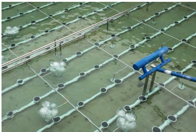
De-coupling aeration from mixing optimizes efficiency and process control.

The Benton wastewater treatment facility is experiencing over 70% energy savings versus a conventional diffused air mixing system designed at the Ten State Standards volumetric airflow rate of 30 scfm per 1000 ft 3 of tank volume.