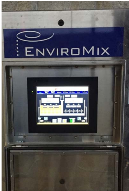
Automatic operation through instrumentation feedback and intuitive operator interface