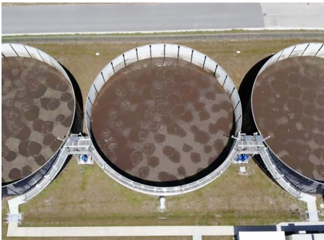
Short duration bursts of compressed air mix an area of the tank 2–3 times per minute.