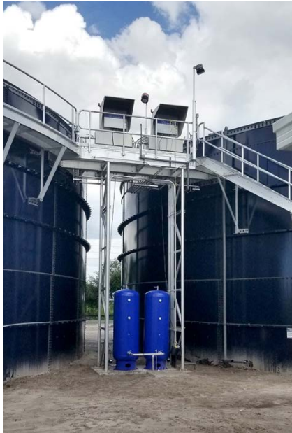
Local control panels distribute the optimal mixing energy.