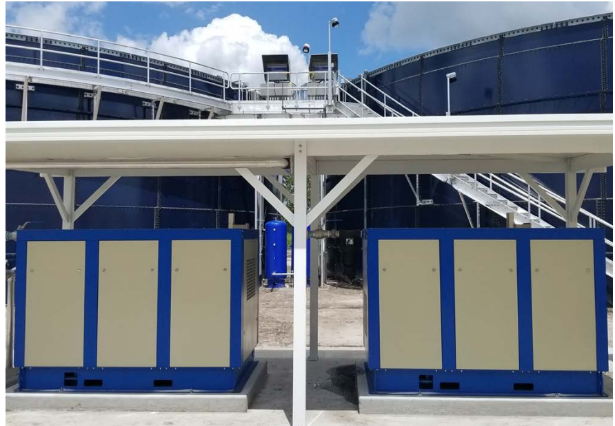
Compressors under a canopy meet the process mixing air demands of the BioMix system for all three equalization tanks.

The BioMix system enables the NRWRF to realize a 90% reduction in O&M costs versus conventional diffused air mixing.