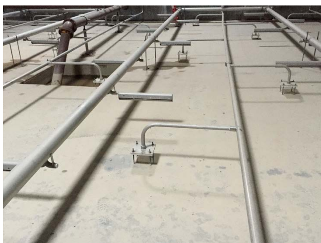
BioMix Compressed Gas Mixing nozzle headers integrated with coarse bubble aeration system

Selection criteria for EnviroMix’s system included both energy efficiency — which was approximately 50% of the energy of a conventional aerated digester alternative — and improved sludge digestion process control so as to minimize phosphorus return in the digester supernatant.