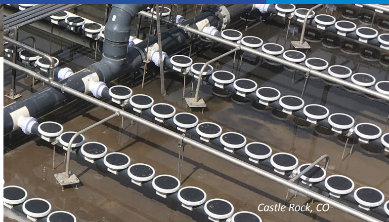
Castle Rock, CO

BioMix provides uniform mixing of tank contents by firing programmed, short-duration bursts of compressed air through patented, engineered nozzles located near the tank floor. The mixing parameters may be adjusted to optimize mixing and power utilization, either through operator input or automated process feedback.