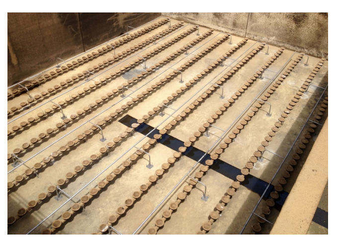
Aeration satisfies oxygen demand while BioMix compressed gas mixing maintains mixed liquor suspension