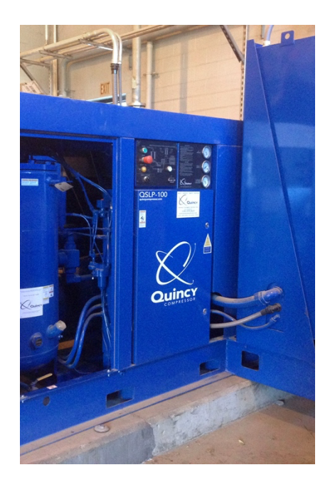
Two 100 HP compressors replaced dozens of mechanical mixers