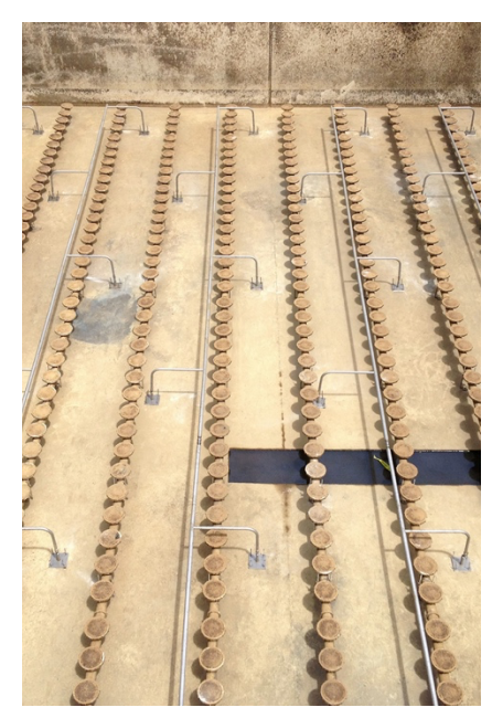
Decoupling aeration from mixing prevents over-aeration