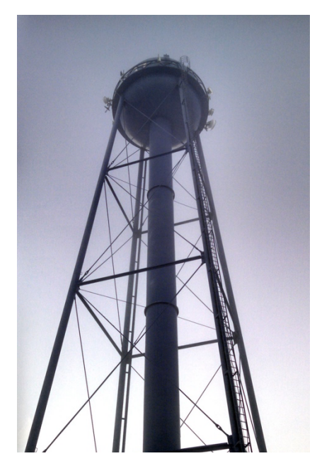
The elevated water storage tank at the Montana Law Enforcement Academy in Helena, MT.