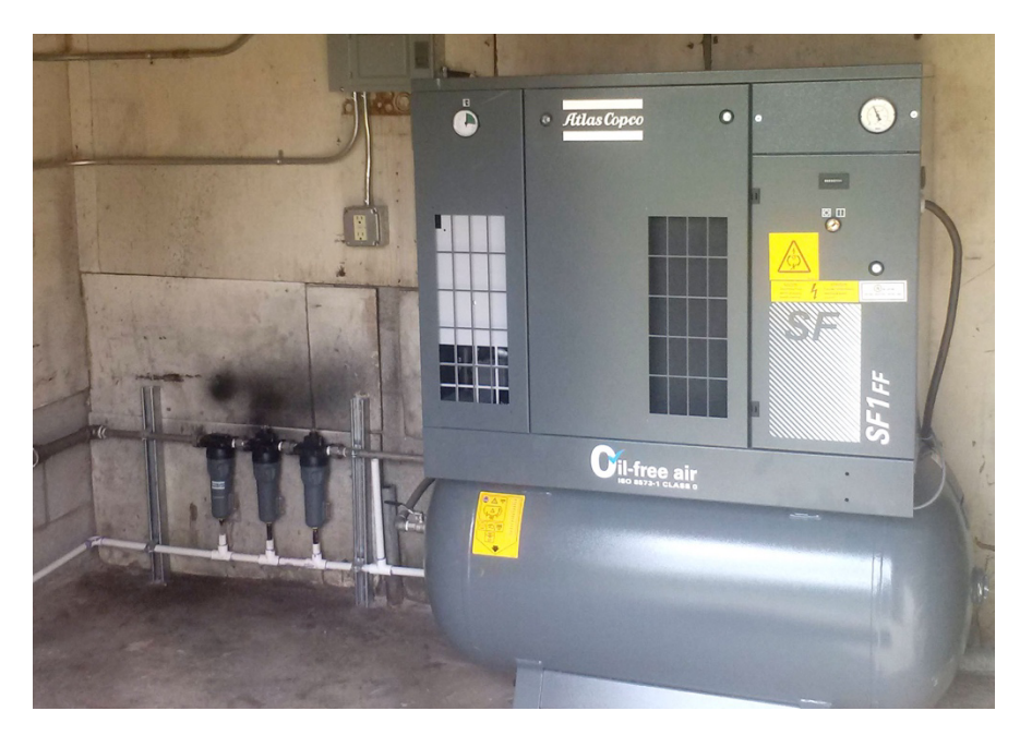
The easily accessible compressor in Opheim, MT.

AquaBlend Potable Water Mixing Systems provide mixing of potable water treatment process basins and water storage tanks using medical-grade compressed air. AquaBlend prevents stagnation and provides freeze protection in elevated and ground water storage tanks.