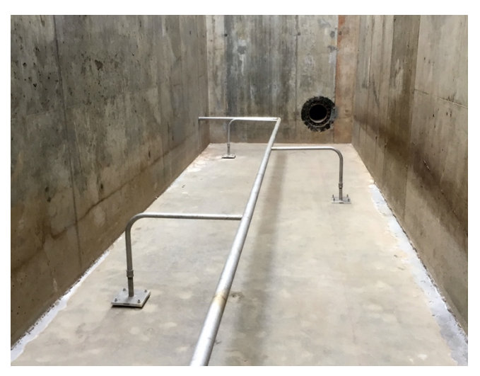
Nozzle headers are well-suited for long narrow basins.