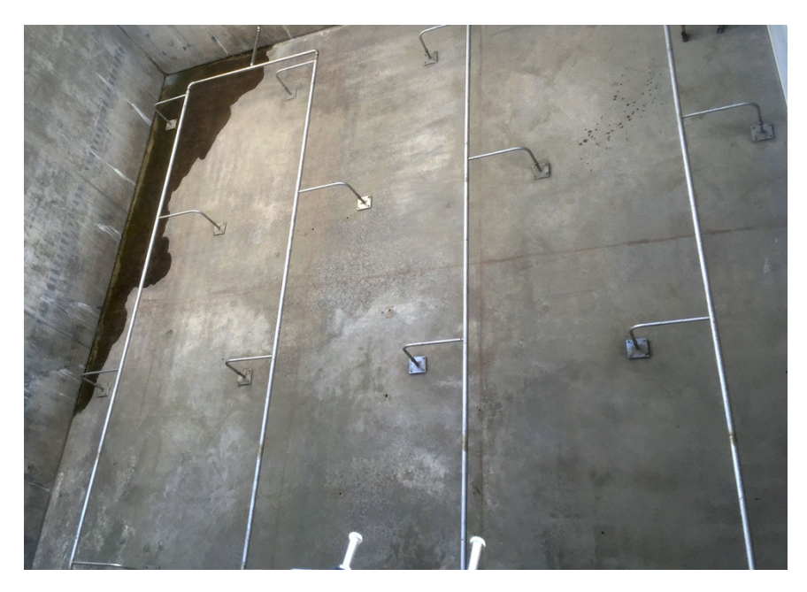
Uniformly spaced nozzles provide effective mixing.

Instead of requiring numerous submersible mixers, BioMix achieves efficient mixing with one centralized compressor, significantly reducing maintenance requirements.