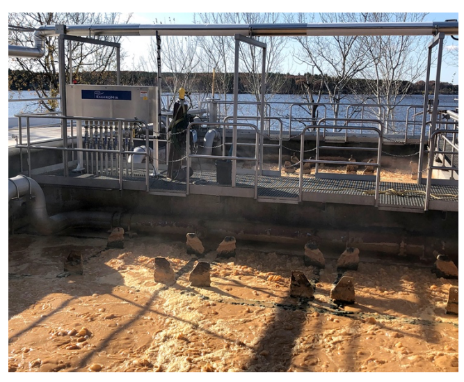
Decoupling aeration from mixing in the MBR basins prevents over-aeration and eliminates solids deposition in the basins.