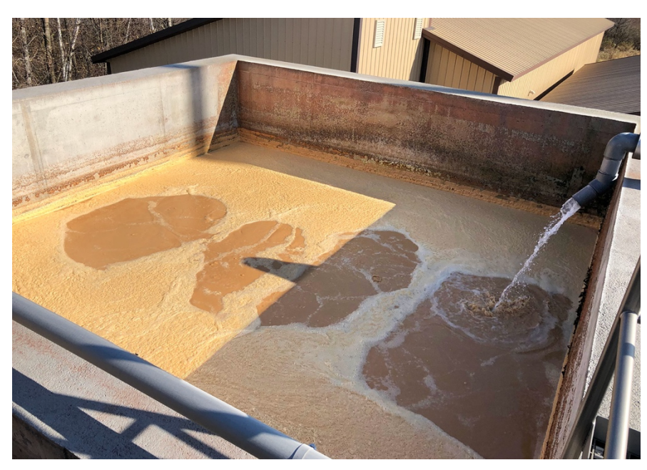
BioMix replaced inefficient jet mixing in the anaerobic selector reducing power use by more than 50%.

Mullins Cheese considered conventional mechanical technologies to provide mixing in the MBR basins and the anaerobic selector tank, but they ultimately selected a BioMix Compressed Gas Mixing System. The decision was based on numerous benefits offered by the system, but the primary driver was that BioMix eliminated the need to perform in-basin maintenance. In the MBR basins, BioMix enabled the plant to decouple aeration from mixing, thus giving the operators independent control over oxygen transfer and mixing. This flexibility eliminated the need to over-aerate the MBR basins to prevent