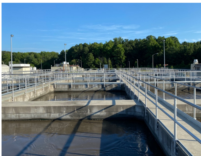
BioMix replaced the jet-mixing system in the anaerobic and anoxic selectors.