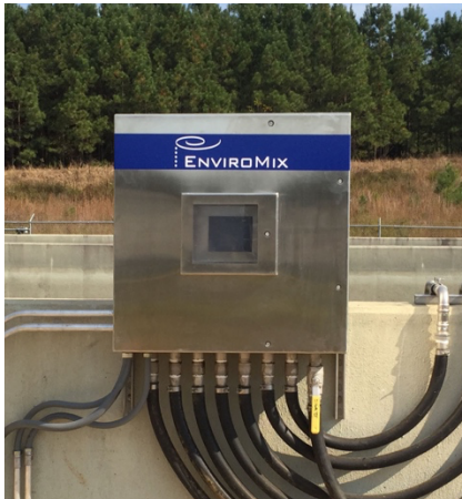
Local valve modules control nozzle firing.