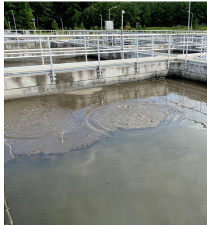
BioMix-DC's long, deep anaerobic fermentation cycle maximizes VFA formation.

"EnviroMix's very good customer service means a lot. We like the whole EnviroMix system, and obviously we've gotten positive results from it."