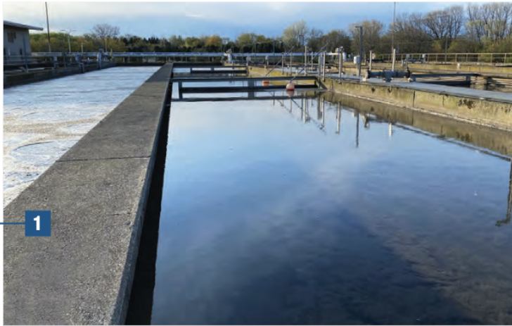
BioMix-DC Enhanced Anaerobic Mixing System optimizes the anaerobic fermentation process by selecting the right frequency and duration of the mixing cycle.